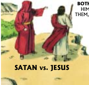
SATAN vs. JESUS

“THEN JESUS WAS LED UP BY THE SPIRIT INTO THE WILDERNESS TO BE TEMPTED BY THE DEVIL... IT IS WRITTEN, 'MAN SHALL NOT LIVE BY BREAD ALONE, BUT BY EVERY WORD THAT PROCEEDS FROM THE MOUTH OF GOD.... IT IS WRITTEN AGAIN, 'YOU SHALL NOT TEMPT THE LORD YOUR GOD... AWAY WITH YOU, SATAN! FOR IT IS WRITTEN, 'YOU SHALL WORSHIP THE LORD YOUR GOD, AND HIM ONLY YOU SHALL SERVE... ” Matt. 4 excerpts