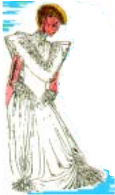
THE BRIDE OF CHRIST

"AND JESUS ANSWERED AND SPOKE TO THEM AGAIN BY PARABLES AND SAID: "THE KINGDOM OF HEAVEN IS LIKE A CERTAIN KING WHO ARRANGED A MARRIAGE FOR HIS SON..." Matt. 22:1-3